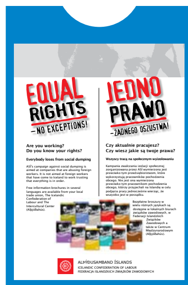
ASÍ leaflet for the campaign on equal rights

The union focused on construction and on the food sector where minority ethnic workers were employed. The union also published brochures in 10 different languages and produced press releases to inform the public about their progress, findings and outcomes. At the same time they placed adverts in the mass media.