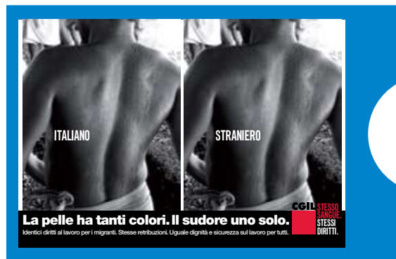
CGIL poster combating racism. The skin has many colours, the sweat only one.

In the area of LGBT issues it has promoted legislation aimed at providing codes of conduct to combat discrimination. In the region of Emilia Romagna it has an agreement with Arcigay, an LGBT NGO, on changing perceptions in the union and in the workplace.