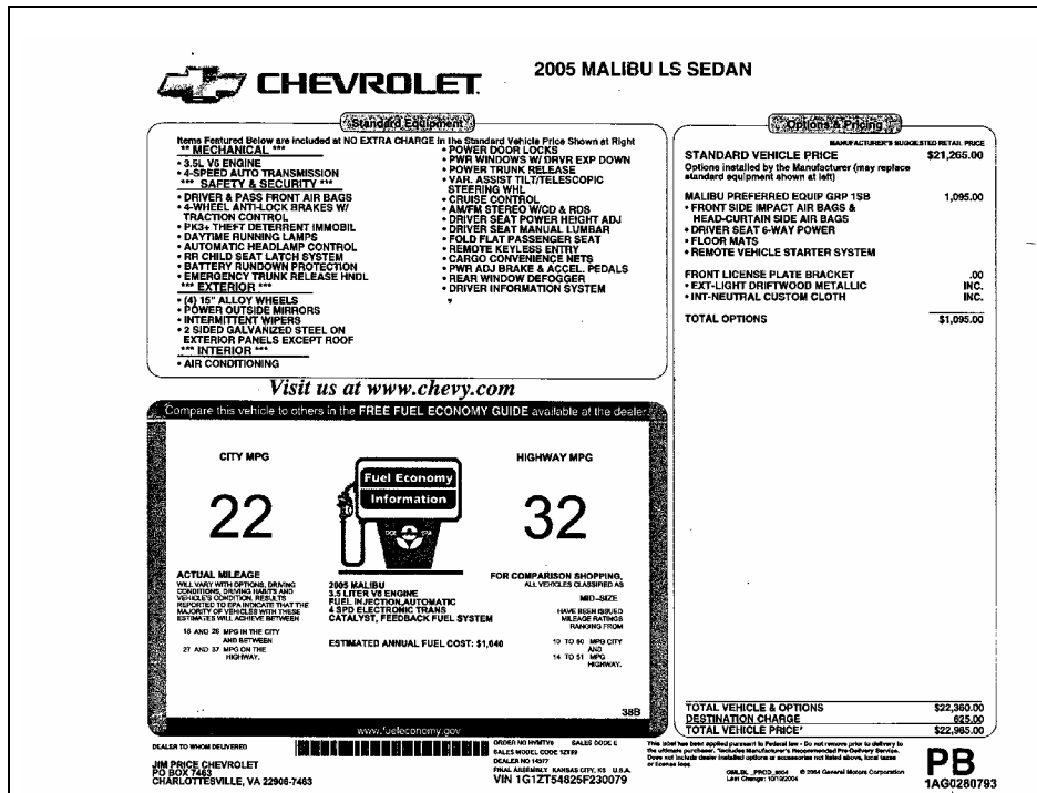
Fig: 1 Sample VON layout for the Chevrolet 2005 Malibu Sedan

While the Vehicle Identification Number (VIN) can be decoded to provide some limited information about vehicle safety features, however, more detailed information on optional equipment specification requires access to databases held by the manufacturers. It is possible, with manufacturer cooperation, to get from VINs the corresponding Vehicle Order Numbers (VONs) that allow the re-creation of the information on the window stickers that are on all new passenger vehicles in showrooms (see Figures 1 and 2 below). Thus, optional safety equipment can be identified this way.