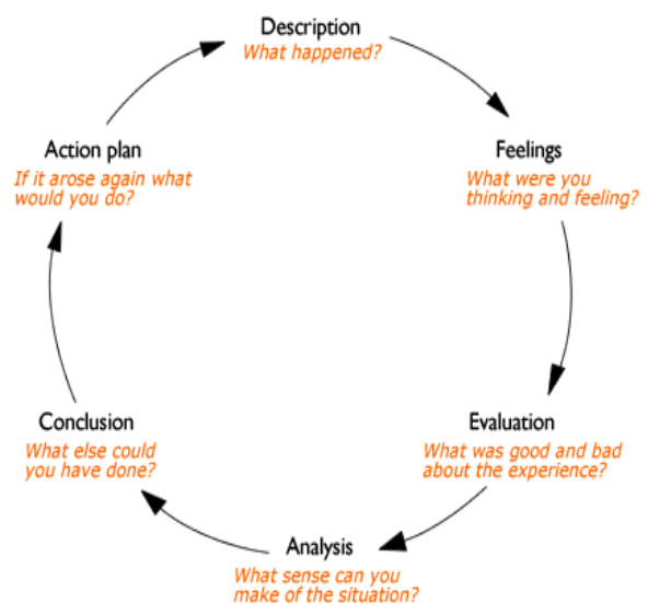
Gibb's Model for Reflection