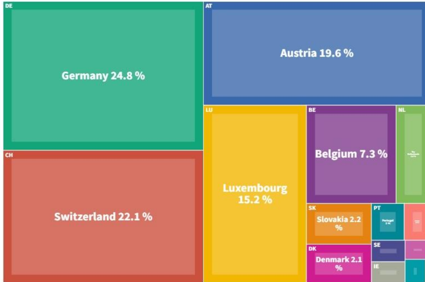
Figure A1 – Number of family members to whom a family benefit was exported, share in total number of exported family benefits, 2022