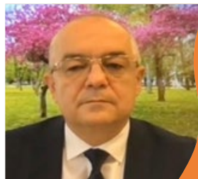
Emil Boc , Mayor of Cluj Napoca, former Prime Minister of Romania

The first thematic discussion on Empowering adults through upskilling and reskilling was moderated by Lidia Salvatore , Adult Learning and Continuing Vocational Training Expert, Cedefop. Emil Boc , Mayor of Cluj Napoca, and Member of the CoR started the discussion by presenting the Cluj Education Cluster and the 'Cluj- future of work' project, which, through a bottom-up approach at local level, aims to develop the skills required by the increasing automatisisation and digitalisation.