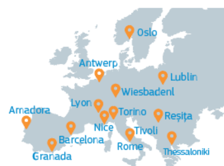
European cities participating at the event

More than 70% of the European population live in European cities, a share that is expected to grow to up to 80% by 2050. Cities and municipalities can be catalysts for the development of apprenticeships by bringing together key players across several levels: local, regional and national. One of the primary goals of the network will be to raise awareness of the potential that the cities have to support apprenticeships. Ultimately, through the network, cities will be able to learn from each other, collaborate, develop tools, share good practices and provide and receive technical and policy assistance.