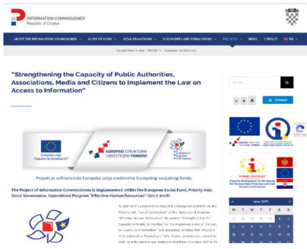
New website of the Information Commissioner of the Republic of Croatia; Source: https://www.pristupinfo.hr/

The project team learnt that greater efforts are necessary to ensure projects of this kind to have a stronger impact on the people using public sector's information. The team also learnt that it would have been better to have implemented a larger ESF-funded project, in order to make a more significant impact. The project revealed certain weaknesses of the current systems used to manage and monitor ESF funding in Croatia. The project has turned the attention of the public towards the significance of policy related to the transparency of the public sector.