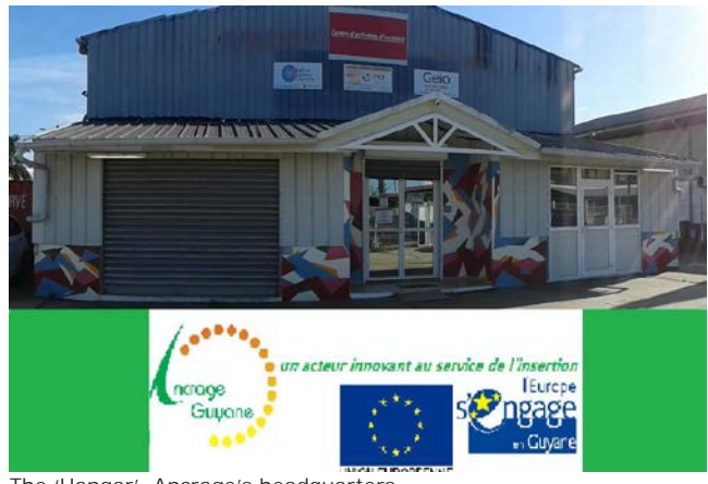
The 'Hangar', Ancrage's headquarters

ESF appears essential to the enhancement of capacity building and development of innovative projects in French Guyana. Yet, structural factors, linked to the Guyanese economy or the actors' management competences, still burden the overall expected results.