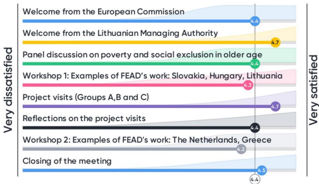
Figure 3. Participant satisfaction by session

The respondents were overall satisfied with the different sessions during the meeting. Participants were satisfied the most with the welcome from the Lithuanian Managing Authority and project visits.