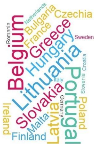
Figure 2. Word cloud of respondents' country of origin

6 participants respectively followed by Belgium, Slovakia and United Kingdom (5 participants per each country).