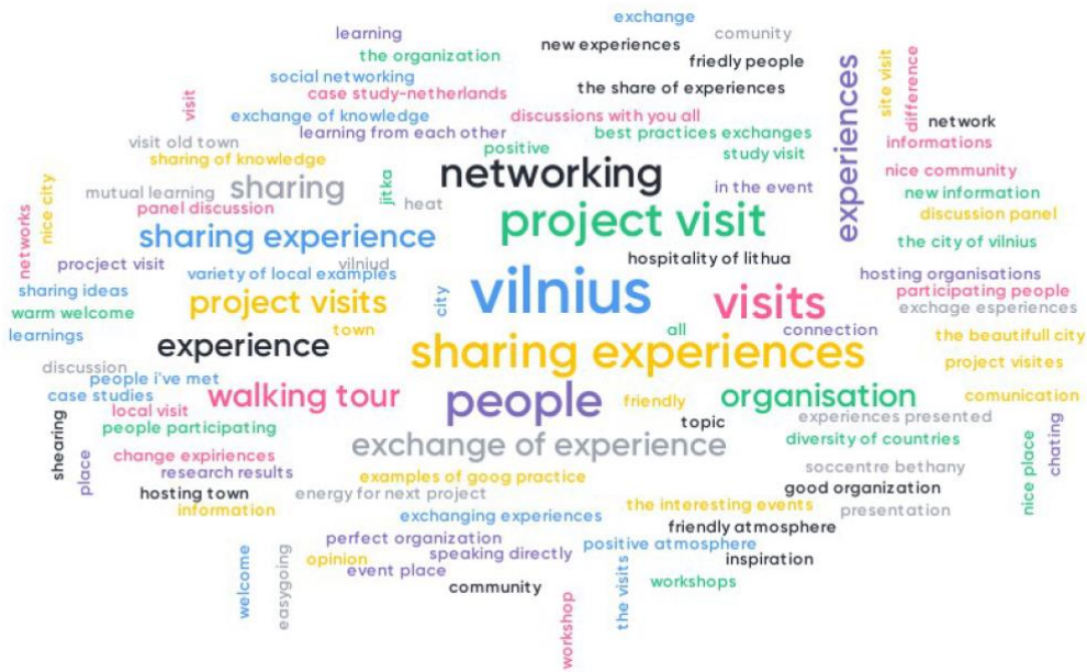
Figure 5. Word map of most liked aspects of the meeting

Most often the respondents indicated that networking, project visits and sharing best practices and ideas were the most liked aspects of the meeting. As Figure 5 shows, the participants valued the opportunity to learn about FEAD practices in Lithuania through the project visits. They also enjoyed their stay in Vilnius, the capital city of Lithuania and sharing their own experiences with the members of the FEAD network.