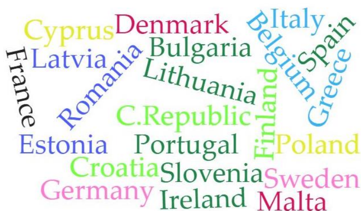
Figure 2: Word cloud of respondents' country of origin

The meeting gathered 87 participants from 22 countries as well as from European level organisations. Representatives primarily came from Belgium, Germany, Lithuania, and Malta, followed by France, Latvia and Portugal.