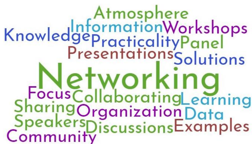
Figure 5: Word map of most liked aspects of the meeting

Participants reported that “networking” was the aspect they liked the most in the meeting. Participants also liked the fact that they could share experiences, exchange best practices, collaborate, and grow a sense of belonging to a community as shown in the following word map.