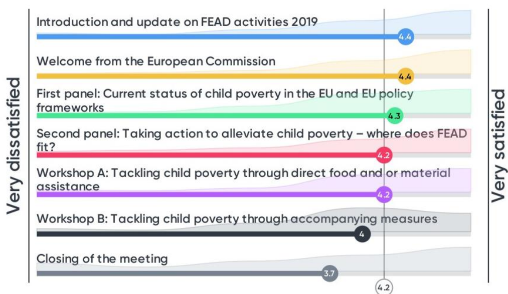
Figure 3: Participant satisfaction by session

In addition to the introduction and welcome words from the European Commission, participants reported they were most satisfied with the second panel, "Taking action to alleviate child poverty and the link to FEAD" and Workshop A, "Discussing FEAD's role in tackling child poverty through direct food and or material assistance".