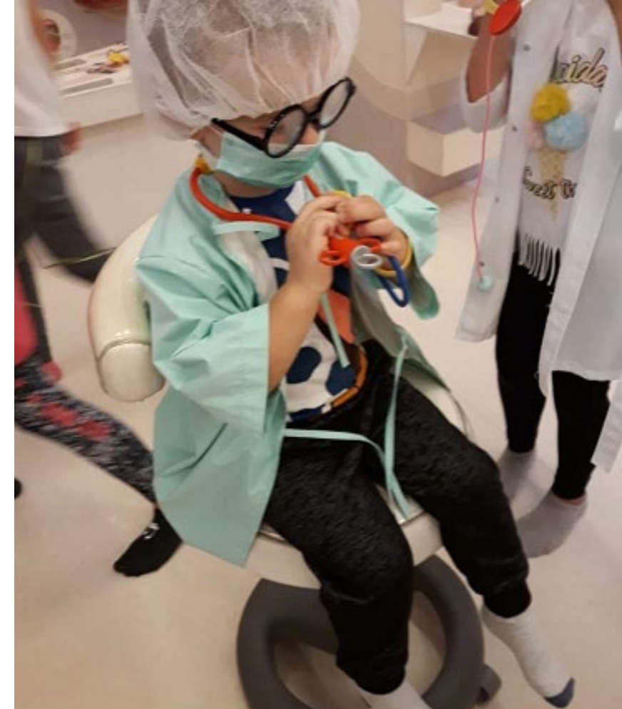
Visit at the dentist's office