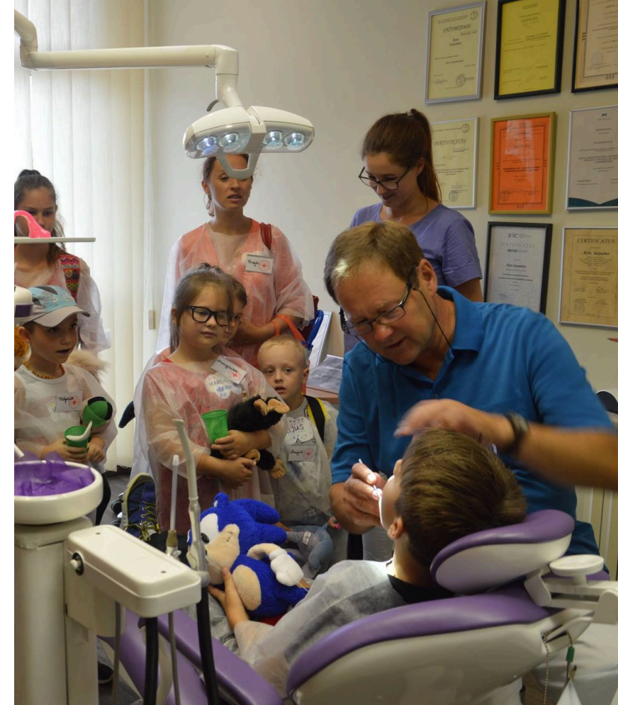
Visit at the dentist's office