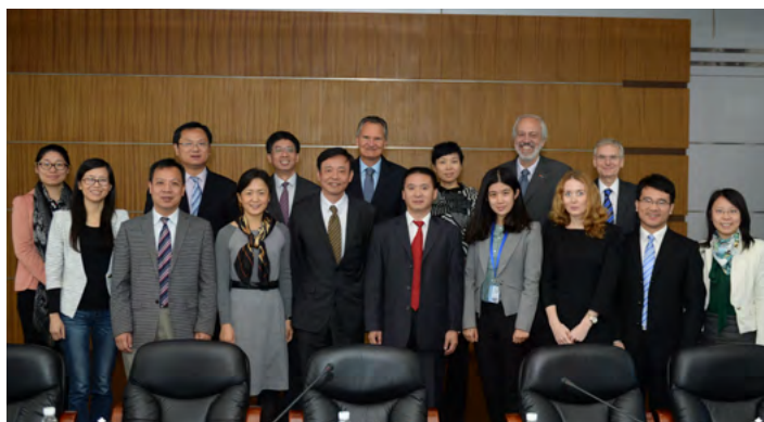
Photo: participants to Euratom-China 4 th Steering Committee meeting

It is expected that the agreed China-EU Co-Fund Mechanism, which also applies to the Euratom Programme, will contribute to increase bilateral nuclear research cooperation.