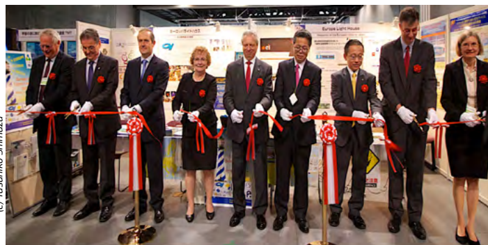
Photo: Inauguration of the European participation at the Science Agora 2015