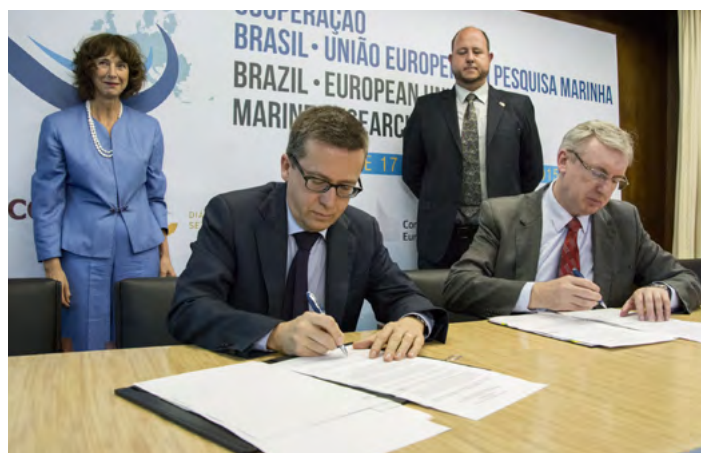
Photo: Commissioner Moedas and Celso Pansera, Brazilian Minister for Science, Technology and Innovation signing the joint declaration for Atlantic Ocean Research