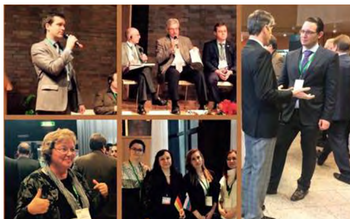
Photo: participants to the conference at the German Embassy in Moscow.

On 17 November, the EU Delegation to Russia took part in the conference «Cooperation between Russia and Germany in bio-economy. Experience in the implementation of research projects in the field of the biotechnology industry», hosted by the German Embassy in Moscow. The conference was organised in the framework of the Russian – German Forum “Bio-economics and Bio-medicine”, held in Moscow and in Pushchino (Moscow region) on 16-18 November. The purpose of the Forum was to extend the cooperation with Russia in industrial bio-technology and bio-medicine. The three-day event was attended by a large delegation from Germany and representatives of the Russian scientific community. The EU Delegation to Russia contributed to the programme of the conference with a presentation on the Horizon 2020 programme with particular focus on bio-related calls under the new Work Programme 2016-2017.