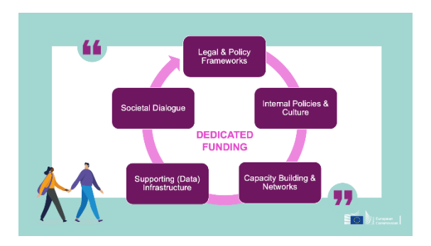
Figure 2: The five categories of enabling factors

In order to co-creatively design actions to address these gaps and needs for Citizen Science (Step C = Creative Solutions) and devise a plan to address them (Step D = Decide on Priorities ), the MLE built on the framework of the 'Enabling Environment' and 'Enabling Factors'<sup>4</sup> that have been explored throughout the MLE.