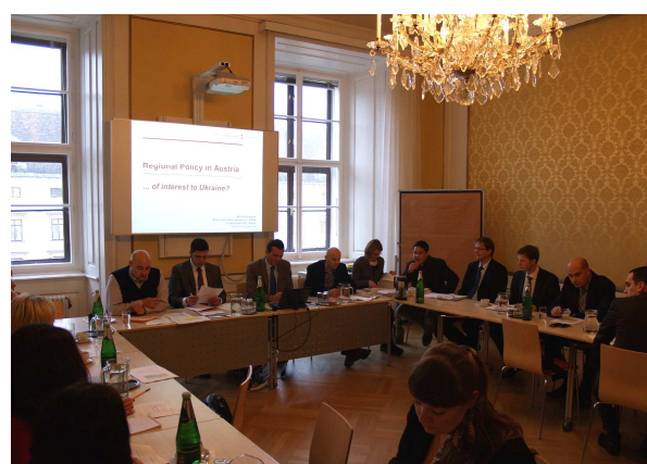
Discussions at the Austrian Spatial Planning Conference (ÖROK)