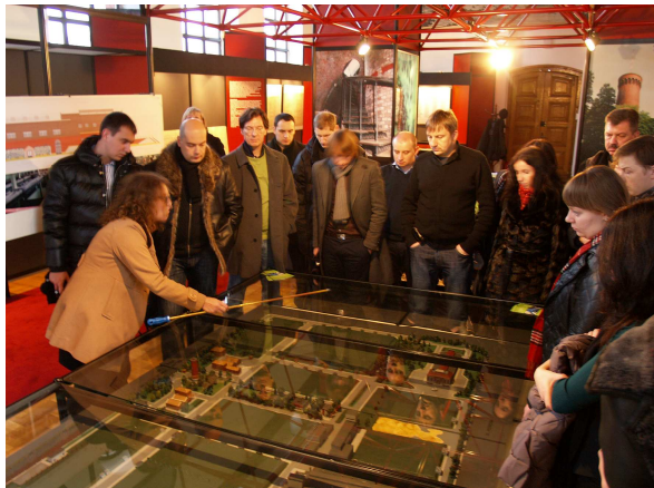
Visit of the water treatment plant in Warsaw