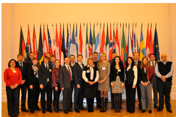
Visit to the OECD in Paris