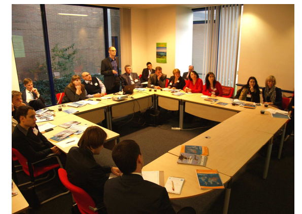
Meetings at the EU Commission in Brussels