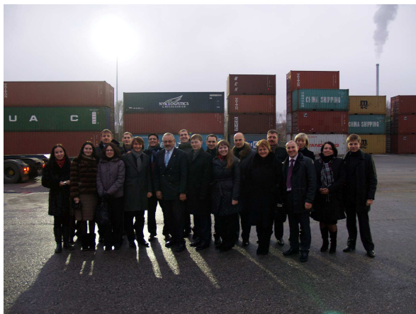
Visit to the Port of Vienna