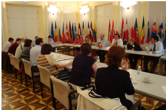
Visit to EU Delegation in Kiev