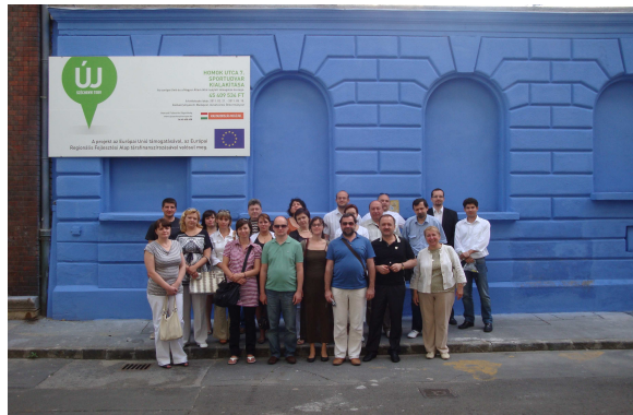
Field visit in Budapest (Magdolna Quarter Project)