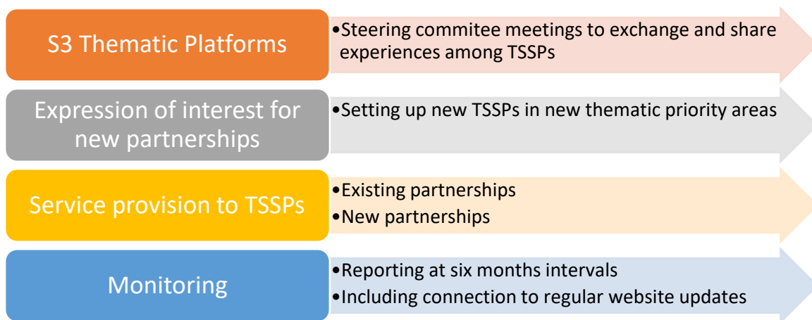
Figure 2: Activities related to Thematic Smart Specialisation Partnerships (TSSPs)

TSSPs and engage in tailored EC support. Further activities are related to TSSPs and include the Call for expression of interest for new partnerships, which is a call and subsequent selection procedure for regions to set up new thematic platforms in priority topics. New and existing partnerships have the opportunity to benefit from services to support their acute needs and development. Monitoring activities take place at six month intervals, related to website updates on the TSSPs. These main activities are outlined in further detail in the chapters below, with a focus on the activities related to the creation of new partnerships.