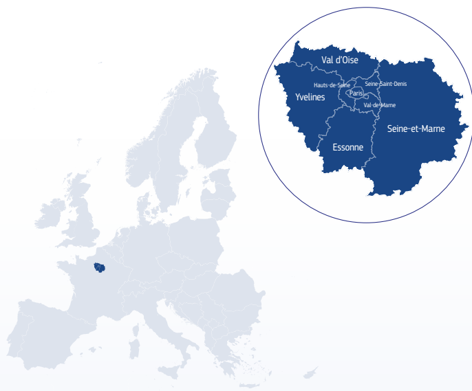
Map of Region of Île-de-France, France.

Île-de-France , the most populated region of France with more than 12 million inhabitants, has recently strengthened efforts in the circular economy. As a managing authority of the European Regional Development Fund (ERDF), the regional government included circular economy as a new theme in the 2021-2027 operational programme. Moreover, the region counts with a Regional Plan for Waste Prevention and Management and a Regional Circular Economy Strategy. 1 The circular economy plays a crucial role in achieving the EU goal of achieving carbon neutrality by 2050, by reducing both the input of new resources and the output of waste and emissions. In order to achieve the objectives under these strategic documents, the region currently has two circular economy-related calls for projects, either ongoing or forthcoming.