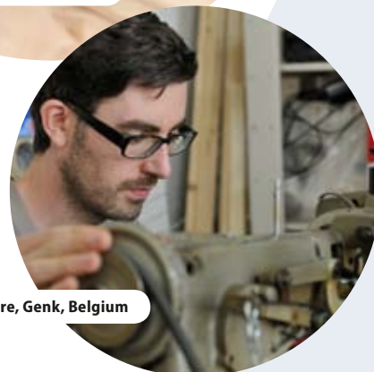
C-Mine Centre, Genk, Belgium