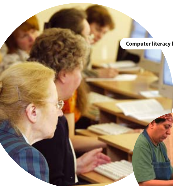
Computer literacy basics for a Lithuanian e-citizen, Lithuania