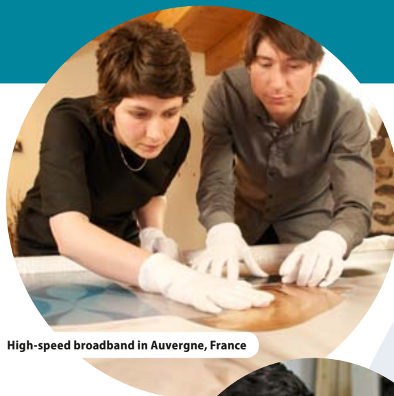
High-speed broadband in Auvergne, France

Videos available here http://ec.europa.eu/regional_policy/sources/video/regiostars2010/genk_fr.wmv