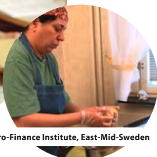
Micro-Finance Institute, East-Mid-Sweden