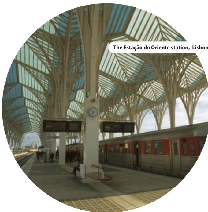
The Estação do Oriente station, Lisbon, Portugal

“ ...an integrated approach also presents challenges for those working on the ground”