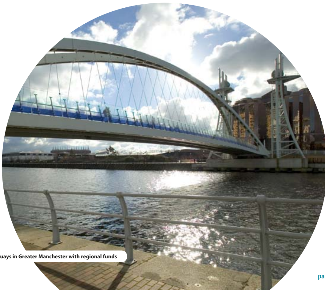
Regenerating Salford Quays in Greater Manchester with regional funds

East Manchester provides a splendid example. The loss of its heavy industry base left the area destitute. But a series of government-funded initiatives consciously targeted at the area over many years by the city enabled it to create a virtual single pot of resources, even though the streams of money were drawn from different departments. The area still faces challenges but has made impressive changes. The secret ingredients include: longevity – tackling problems consistently over decades; scale – an area of over 1 000 hectares which gives it heightened political salience; community participation – with an initial programme of genuine local consultation and involvement; commitment – with able, unchanging staff; and comprehensiveness – simultaneously tackling jobs, schooling, housing, health, crime.