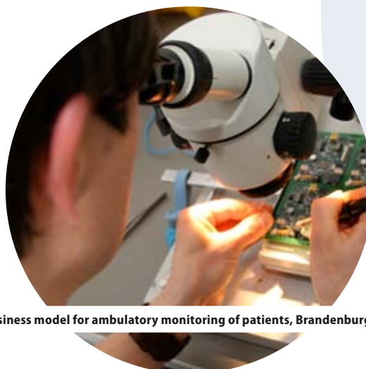
New business model for ambulatory monitoring of patients, Brandenburg, Germany