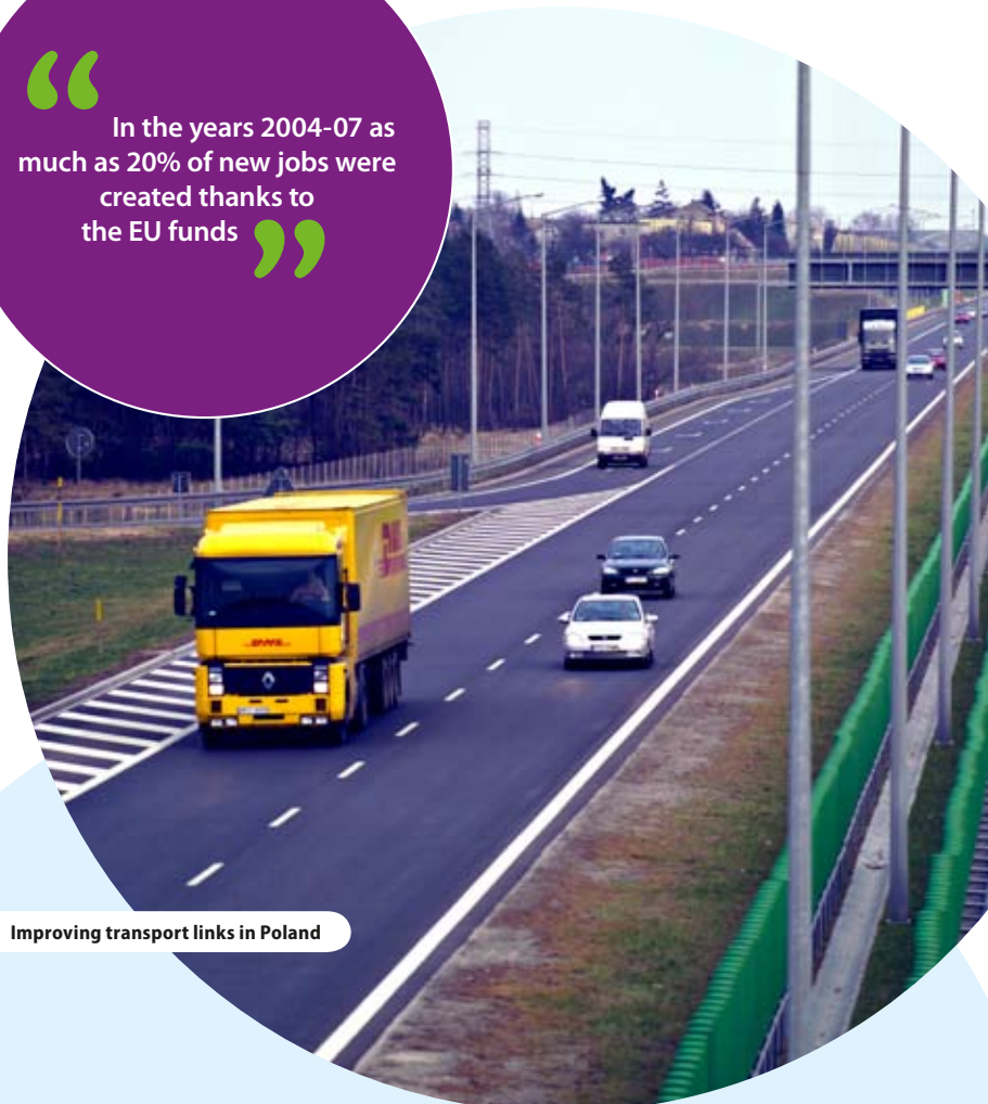
Improving transport links in Poland

“ In the years 2004-07 as much as 20% of new jobs were created thanks to the EU funds ”