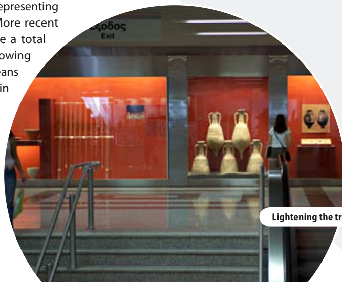
Lightening the traffic load in Athens