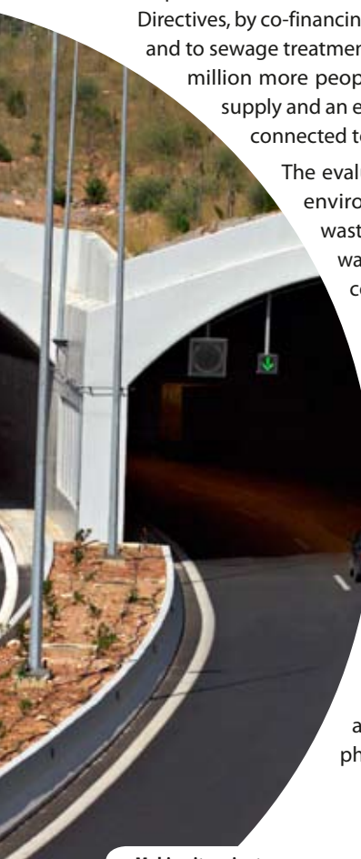
Making it easier to move around Greece

Direct instruments (i.e., financial support, mostly grants but also loans and equity) are still the mainstay of ERDF support to enterprise and innovation, accounting for some 69% of spending over the period. The evaluation identified a trend from a narrow ‘restructuring and diversification strategy’ towards broader strategies with a greater emphasis on innovation and a wider range of instruments. The use of indirect instruments (e.g., non-financial support such as business services, reduction of administrative burdens, clusters, networks and knowledge transfer) grew considerably over the period. The variety of instruments was most obvious in support to smaller enterprises – in contrast, support to large enterprises was almost exclusively in the form of non-repayable grants.