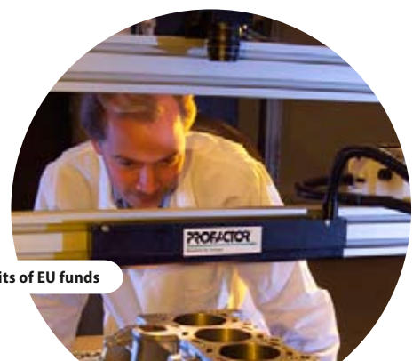
The Profactor project showed the benefits of EU funds

“The long track record of programme monitoring in Germany provides a firm foundation for the increasingly wide-ranging indicators being tracked today”