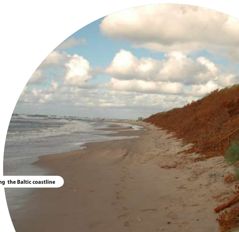
Protecting the Baltic coastline

“ The planning period 2000-06 confirmed the value and function of a European regional Cohesion Policy ”