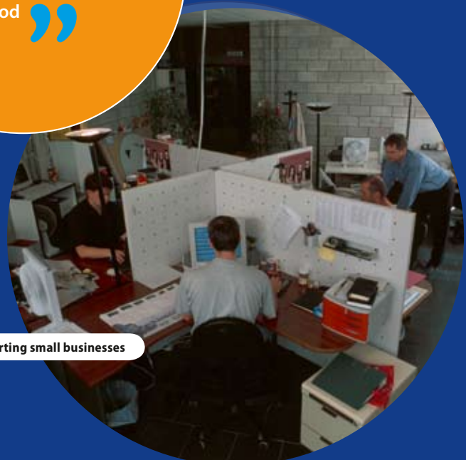
Supporting small businesses

Yes and no. It is clear that funding needs to be large enough to make a difference which implies it should not be spread too widely across policy areas. But because regions differ in terms of the problems they face and their specific needs, which are hard to identify centrally, there is a case for allowing them to choose a limited number of areas on which to concentrate funds. This would also make it easier to monitor and evaluate Cohesion Policy.