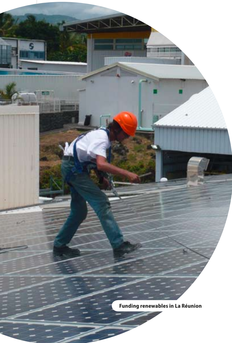
Funding renewables in La Réunion

“ What began as a duty for programme control is now becoming an example of modern management in public administration ”