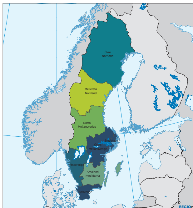
Sweden: Regional innovation performance, 2017