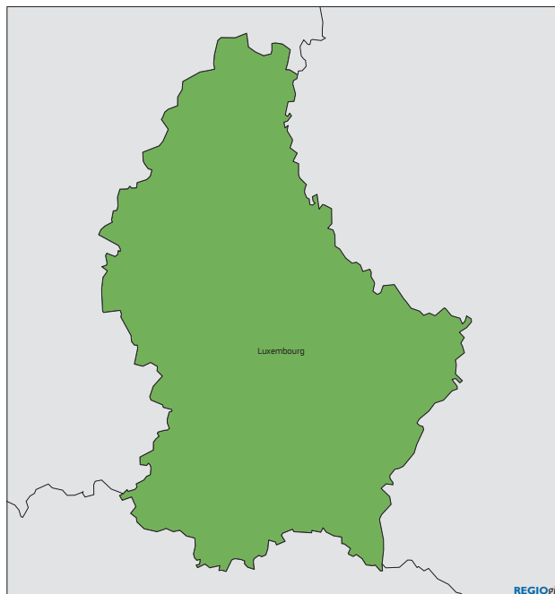
Luxembourg: Regional innovation performance, 2017