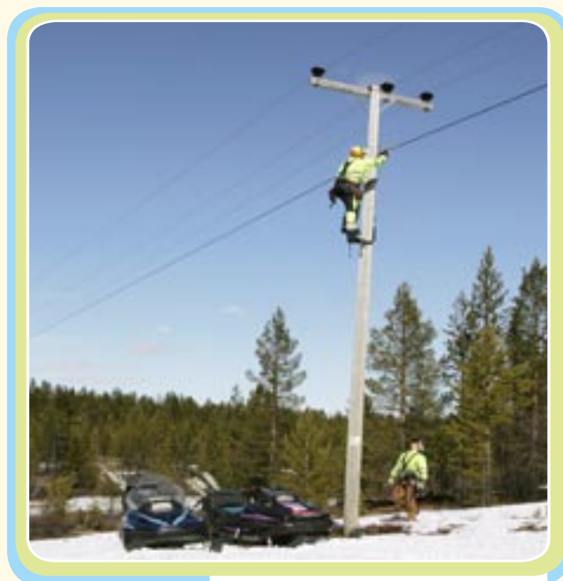
Broadband – an online lifeline for Sweden's more remote communities

The total cost of the project amounted to €10.2 million, with the EU contribution totalling €4.5 million.