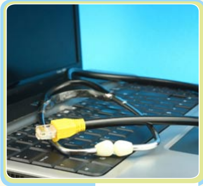
The doctor is now only a click away for the people of Literatuurwijk in Almere

The project was developed around a health-care centre in the Literatuurwijk district. The portal has effectively become the virtual branch of the health centre. People who do not have access to the Internet can also visit the health centre and use its Internet facilities. Inhabitants of the Literatuurwijk district can use the Internet portal to communicate with the police, the local doctor and other local service providers. All queries and requests are answered within a reasonable time frame, and there is also a digital bulletin board where inhabitants can communicate with each other.