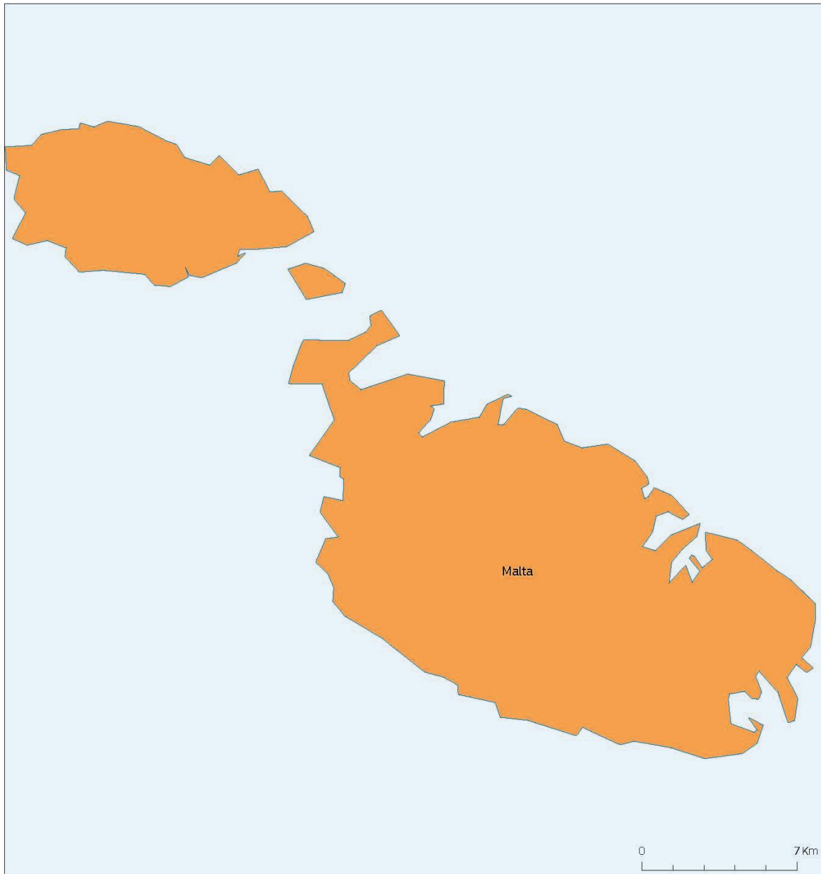
Malta: GDP/head (PPS) by NUTS-2 region, 2014