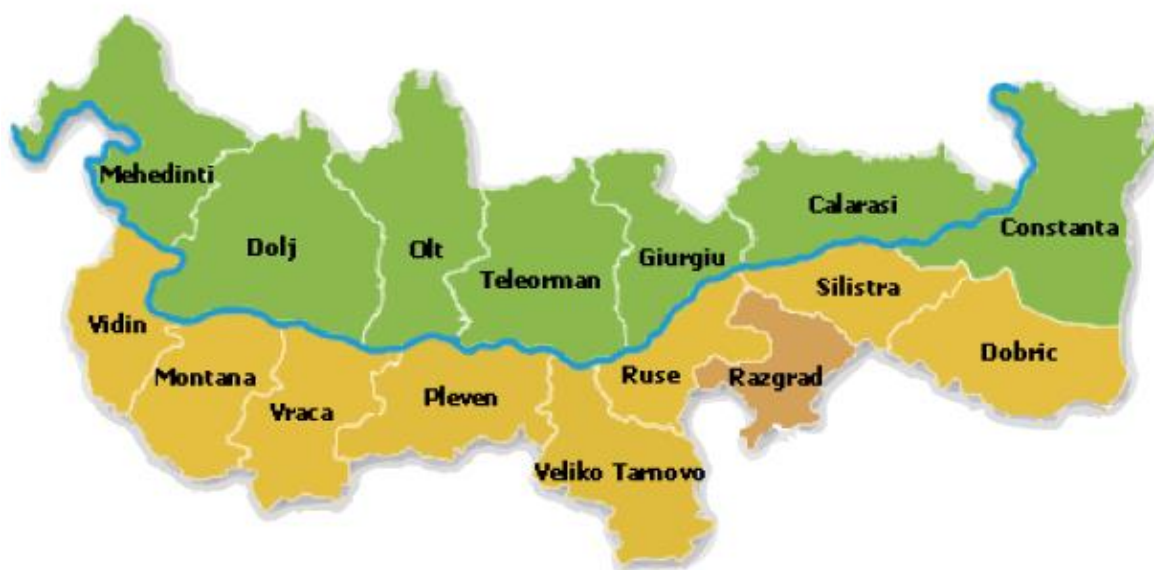
Figure 1: Map of the eligible area

The Operational Programme is financially large : it has a total budget of EUR 255,189,999 million, to which the European Union contributes with an ERDF amount of EUR 213,413,977 million (this compares to an average of EUR 100 million for Strand A programmes).