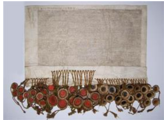
The Union of Lublin Act's copy – the original is stored at the States Archives in Lublin

The project has a clearly stated mission to build awareness of European integration in the 21st century by tracing links to the attainments of the Union of Lublin, and the subsequent experiences it fostered of religious toleration, and cultural diversity as well as democratic values. This is the starting point for a new branding strategy for the town alongside the promotion of joint projects focused on common memories of this multi-national community in the territory of the former commonwealth neighbours, including Belarus and Ukraine, as well as with Lithuania. The city will enhance existing initiatives, specifically its website, schools programme, "Union Day", with a media campaign, combined with the development of a new tourist trail with explicit emphasis on European integration, and the promotion of European values. The submitted project meets the criteria for the European Heritage Label.