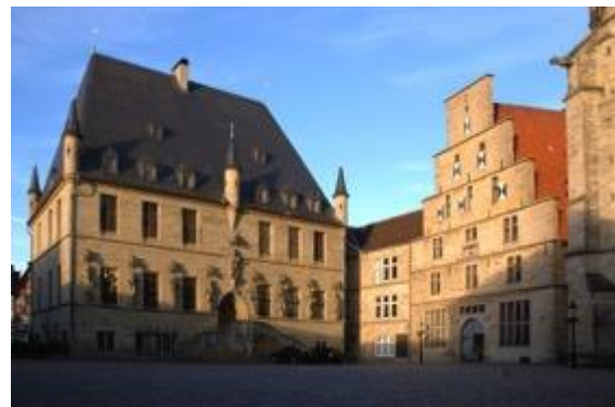
Town Hall of Osnabrück