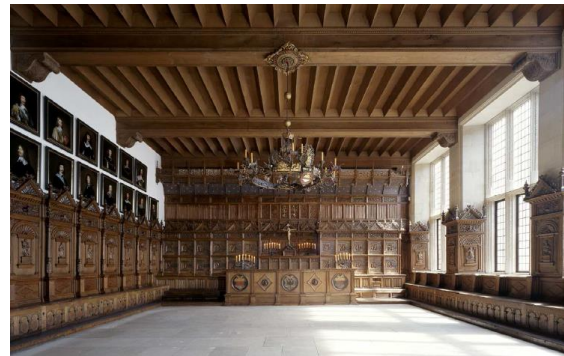
Town Hall of Münster

The two town halls of Münster and Osnabrück have planned a series of measures to further improve the communication of their European significance. Some of the planned activities build upon existing activities including youth and educational programs, and the use of artistic events to create synergies between history and contemporary creation. New multilingual products will be put in place, such as a brochure on “The Town Halls of the Peace of Westphalia”, a bibliography that will be made widely available, as well as training, exhibitions and public discussions. The submitted project meets the criteria for the European Heritage Label.