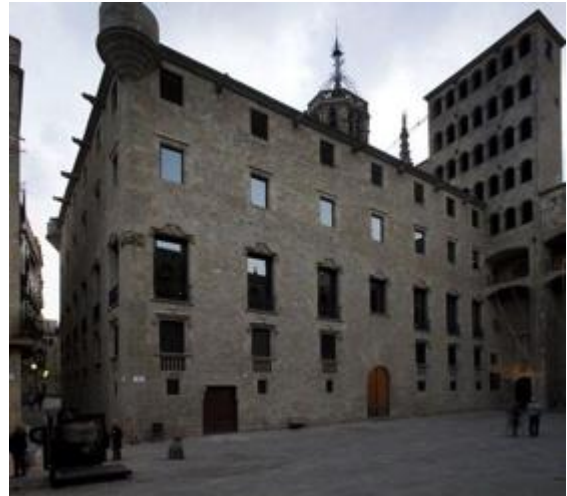
The Palace of the Viceroy

The proposed project builds on activities already in motion such as the improvement of signposting and the organisation of thematic exhibitions. The main aim of the project is to emphasise the European dimension of the Archive and to enhance access for several audiences to its collections through digitalisation and public engagement via the Internet, as well as in situ visits and thematic documentary exhibitions, and other activities. The submitted project meets the criteria for the European Heritage Label.