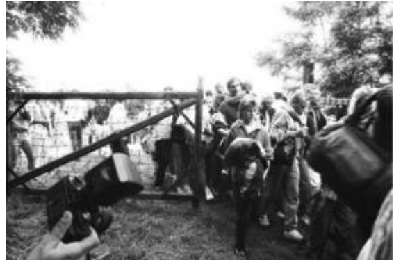
Original photo illustrating the break through the border

The long-term plan (after 2018) includes provision of improved infrastructure and the construction of an interactive visitor centre; care should be taken to ensure these keep the spirit of the site. The submitted project meets the criteria for the European Heritage Label.