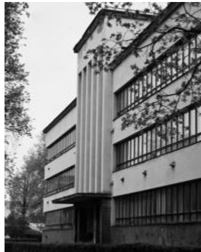
KTU Faculty of Chemical Technology

These key activities will be developed further, addressing the issues of mobility, partnership and education and involving partnerships of the City Hall, universities and various non-governmental organisations. Young people are especially targeted by the project. Significant international promotional activity will be expanded with a view to supporting the preservation of this rich heritage ensemble. The submitted project meets the criteria for the European Heritage Label.