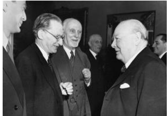
Alcide de Gasperi with Winston Churchill, in London (1951)

The museum is also organising a joint conference with similar sites in Europe and the existing network of houses of the "Fathers of Europe" is to be promoted and extended.