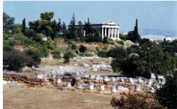
The Ancient Agora

It will apply the use of new digital technologies and creating networks and synergies with other initiatives, as well as developing conservation strategies to meet the challenges of maintaining the site as a "stage" and open-air gallery.