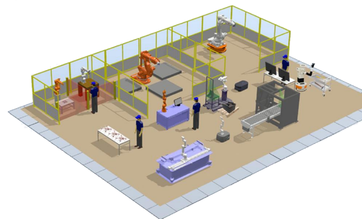
Pilot factory for collaborative manufacturing, assembly and inspection