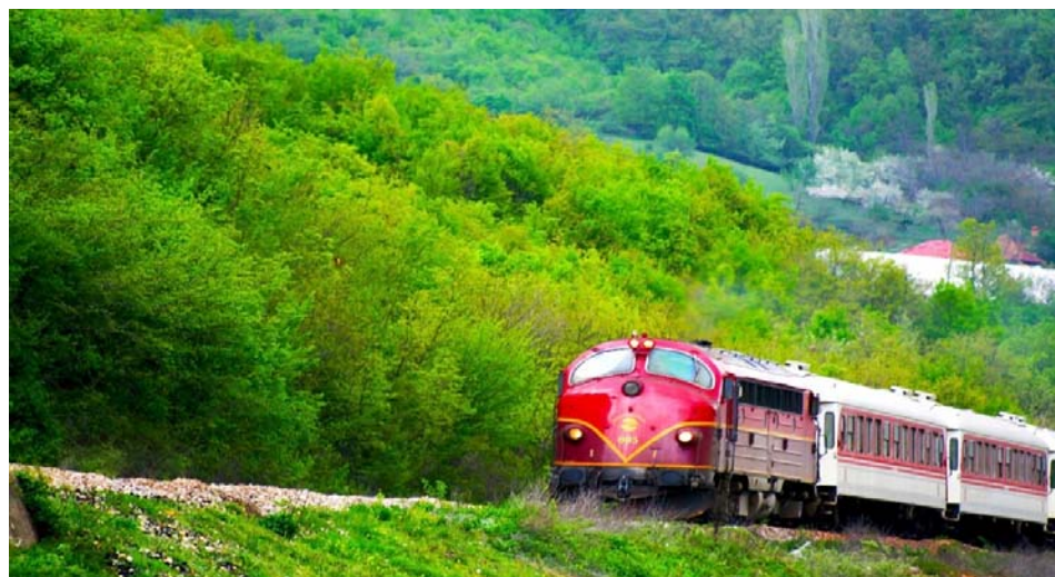
Passenger transport on Railway Route 10, close to Fushë Kosovë / Kosovo Polje.