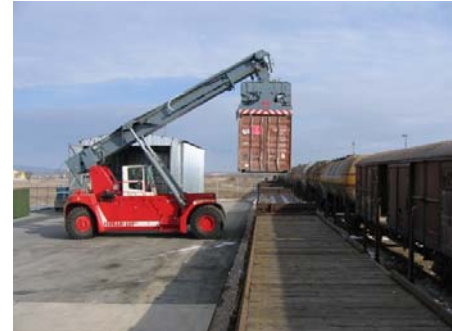
Freight transport on Route 10.

This investment project 1 will enable outdated switches, tracks and trackbed, culverts, bridges and tunnels along the Fushë Kosovë / Kosovo Polje – border with the former Yugoslav Republic of Macedonia route to be replaced or renovated.