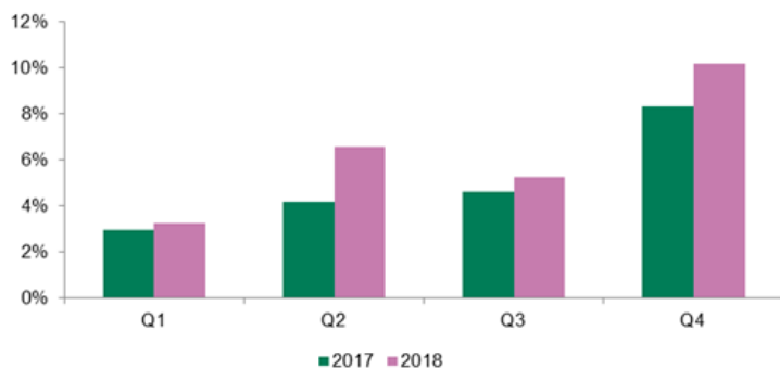
Figure 2: Market share of green, social and sustainability bonds

In the European bonds market, the green, social and sustainability bonds, excluding government issuances, already represented, on average, 4-5% since 2017 and have risen to approximately 10% of the total amount of bonds issued by European issuers in the last quarter of 2018 (see below).