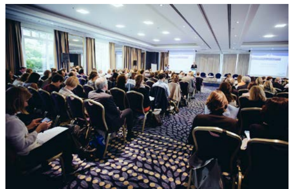
EMN 10 Year Anniversary Conference

The year 2018 marked the ten year anniversary of the establishment of the European Migration Network. For this reason, the EMN organised the conference “Understanding Migration in the EU: past, present, future” on 15 May in Brussels. The conference welcomed high-level speakers from a diverse range of European and international organisations, including the European Commissioner for Migration Mr. Dimitris Avramopoulos. In a balanced debate, the speakers shared their perspectives on migration and asylum policy, reflecting on lessons learned over the past decade and how these experiences can shape the future of migration policy and practice.