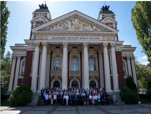
Delegates at the EMN Conference 2018 in Sofia

In 2018, the EMN Conference “Crossroads of migration: Challenges and success factors in managing migration flows” took place on the 31 May and 1 June in Sofia, Bulgaria .