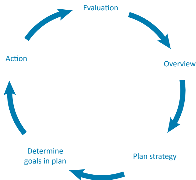
Figure 1. Public health working process as described by the Norwegian Public Health Act.

The responsible agency: Political leadership, i.e. municipality council and the county parliament, respectively, and the chief county administrator, Norwegian Institute of Public Health, Norwegian Directorate of Health, the Minister of Health in different specified roles.