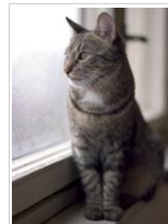
Pets and pests are sources of allergens

Indoor temperatures that are too high or too low are unpleasant and can be unhealthy.