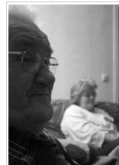
Some people are more vulnerable than others to indoor air pollution

Factors other than age and presence of cardiovascular or respiratory diseases that may render some people more vulnerable are genetic traits, lifestyle, nutrition and other health problems.