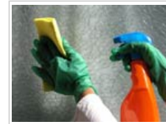
Several household cleaning products emit chemicals

Some indoor air pollutants come from the outside, but most are released inside the building, for example when cleaning or when burning fuel for cooking and heating. Furniture and construction materials can also emit pollutants. Dampness and lack of ventilation may further increase indoor air pollution.