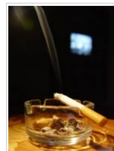
Tobacco Smoke contains several types of harmful pollutants

Volatile organic compounds (VOCs) such as benzene , formaldehyde and naphthalene which are known to have health effects are emitted by many consumer products. VOCs may react with ground-level ozone to form secondary pollutants that can cause irritation. Altogether, the concentrations of VOCs and ozone causing mixture effects are as yet poorly known.