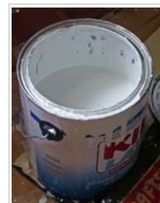
Certain paints emit chemicals

A recent study investigated the emissions of chemicals from a large number of different consumer products. Although typical levels in indoor air were in most cases acceptable, in some occasions, accepted limits were exceeded.