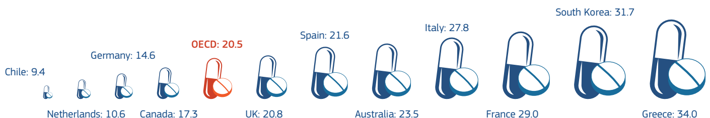
There is a high variability of antibiotic consumption across OECD countries. Antibiotic consumption in 2014 (defined dose per 1000 inhabitants per day)