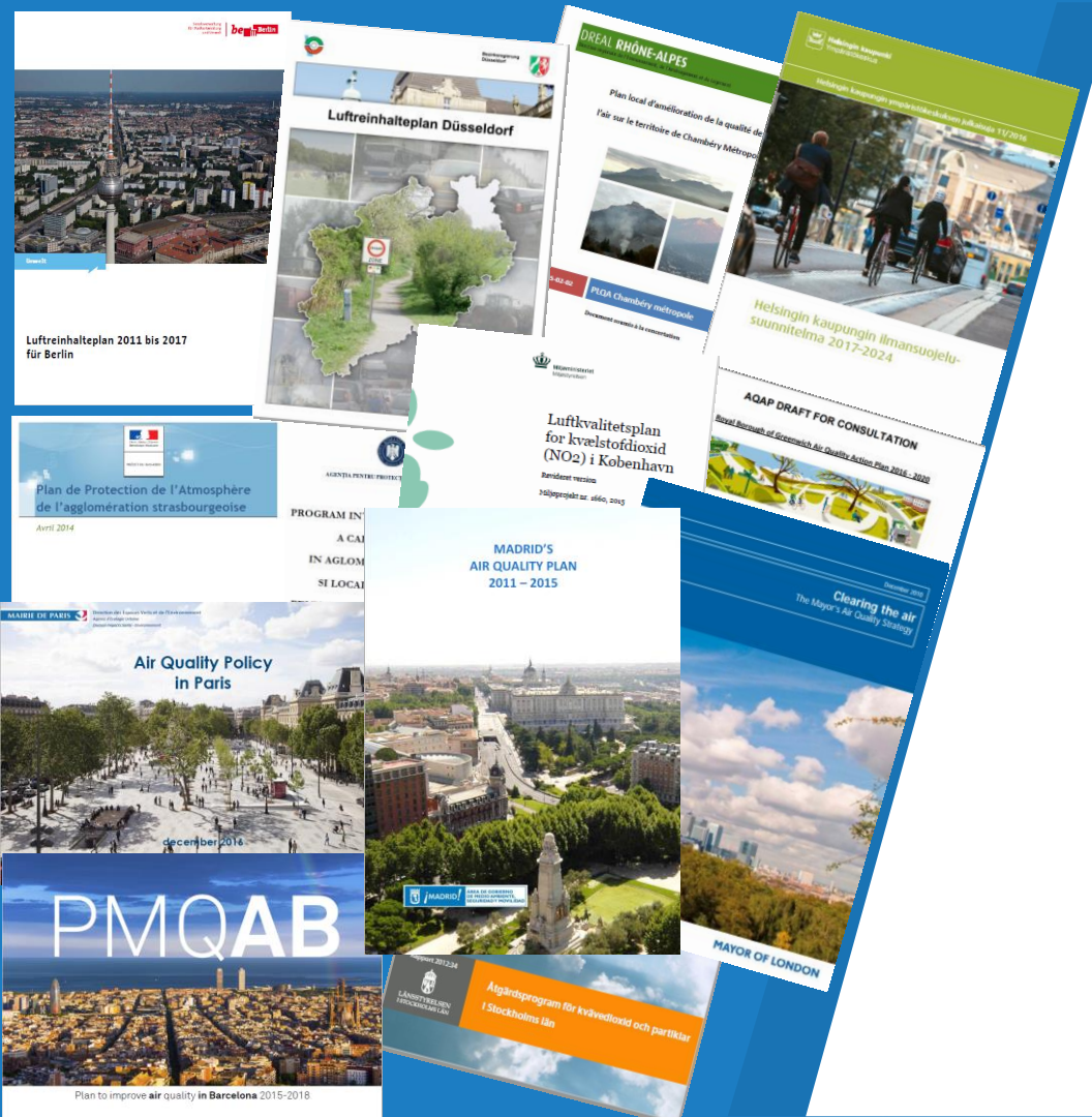
Luftreinhalteplan 2011 bis 2017 für Berlin

25 existent Cities Air Quality Action Plans and several Cities Strategies to improve Air Quality have been collected by mean of a WP4 Questionnaire sent to Cities Members of the Partnership and other channels (Eurocities network, Futurium platform)