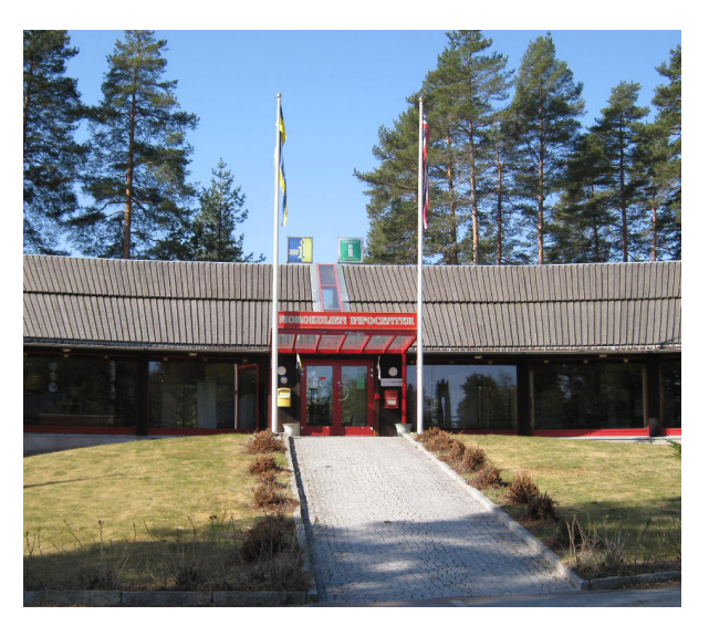
Morokulien, Source: Värmland County

The EURES cross-border partnerships are not the only organisations providing support and advice to cross-border workers. In particular, in border areas with significant levels of cross-border commuting there are also other services available that help citizens to find adequate answers to their manifold questions that arise when they decide to live, work or set up a business in the neighbouring country. For example, with the support of the Nordic Council of Ministers particular Border Service Centres were set up that provide personal assistance and guidance to cross-border workers that have