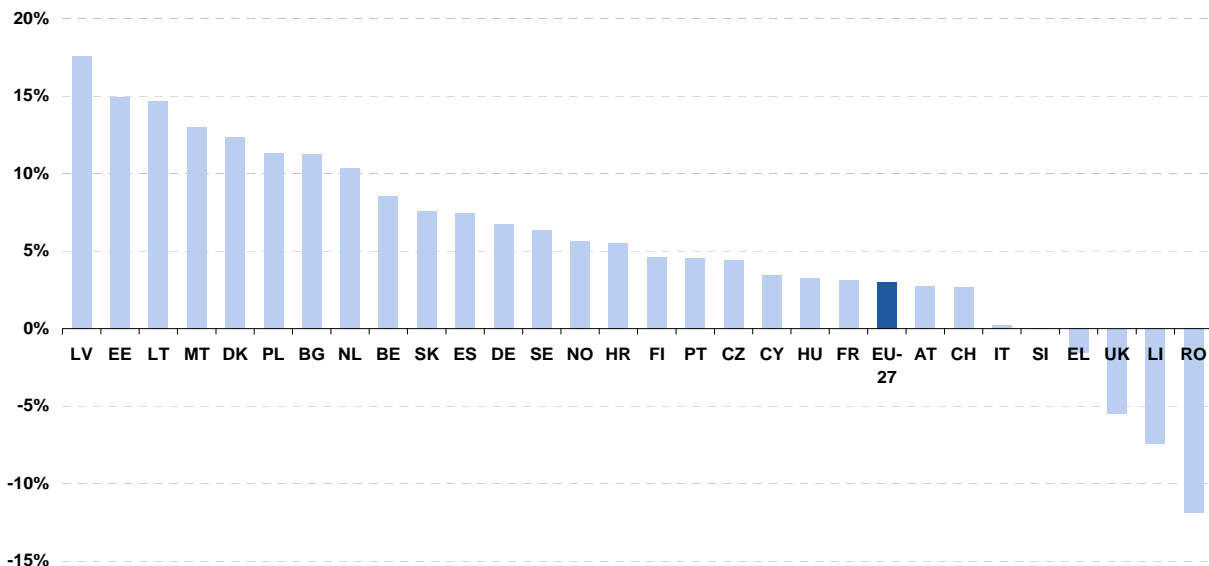
Figure 1: Percentage change in number of nights spent in hotels and similar establishments, non-residents and residents, June-September 2010 compared with the same period in 2009.

The most popular destinations for foreign tourists were Spain, Italy and Greece, together accounting for nearly half of all nights spent by non-residents in the EU-27.