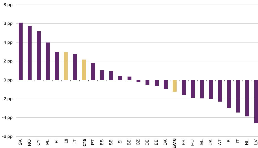
Figure 2: 2007/2009 changes in relative real adjusted gross disposable income of households per capita Purchasing power standards (PPS), EU27 = 100, in percentage points

Source: Eurostat (online data code: nasa.nf.tr ) Note: BG, LU, MT and RO missing but estimated for EA16/EU27 aggregates