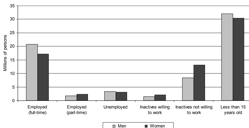
Figure 1: Population by sex and activity, CC-11, 2001