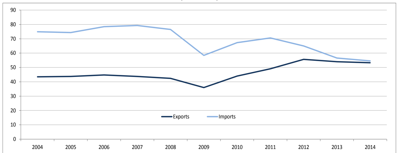
Evolution of EU exports and imports of goods with Japan, 2004-2014 (in € billion)

On the occasion of the European Union – Japan summit, which will take place on 29 May in Tokyo, Eurostat , the statistical office of the European Union, issues data on trade and investments between Japan and the EU .