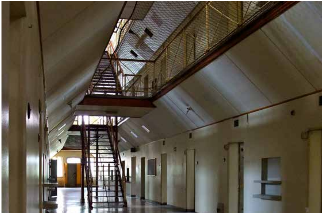
Philidelphia-style prison wing, Turku, Finland

that may prevent imprisonment from being a credible punishment for environmental crime. They discuss the practice in Belgium of issuing — but not implementing — ‘short’ prison sentences (those with a maximum term of six months). They also discuss lack of space in prison facilities, which may influence the failure to execute prison sentences. The authors say that, while prison sentences do not have to occur frequently, they should be implemented occasionally to deter criminals and retain the credibility of the threat. This is important, as the effectiveness of other enforcement practices hinges on the presence of this ‘ultimate threat’.