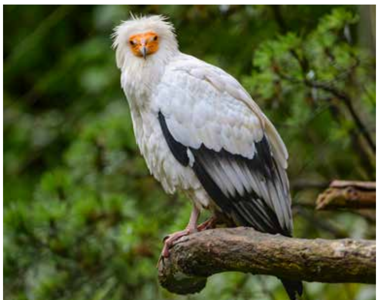
Egyptian vulture on the branch.

The VENENO project , funded by the EU LIFE programme, ran from 2010 to 2014 and aimed to protect these species and reduce illegal poison use in Spain. Evidence shows that legal instruments and action against wildlife poisoning can reduce the number of incidents. Thus, a major goal of VENENO was to develop action plans — which describe how illegal poisoning can be avoided — and to establish protocols to be used to pursue and penalise those responsible. As well as creating an Action Plan for the Eradication of the Illegal Use of Poison in the Countryside , four protocols were developed, including procedural protocols for wildlife