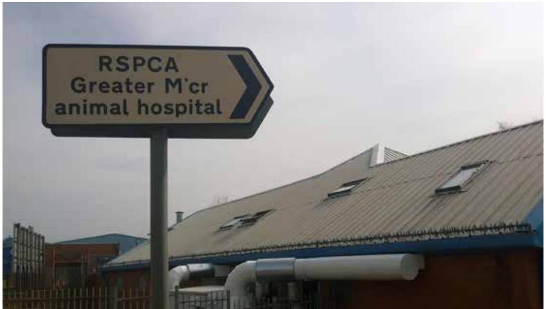
The Greater Manchester Animal Hospital, Salford, UK.

a perception among governments that wildlife crime is an environmental, rather than a criminal justice, issue.