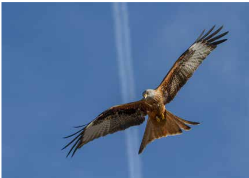
Red Kite _MG_1795.

rescue centres and toxicology laboratories and a legal protocol for administrative action and criminal proceedings.