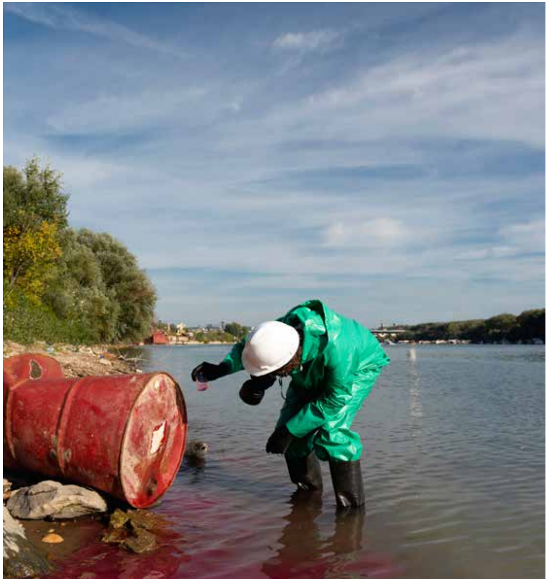
Chemical pollution site.

However, by cutting the number of physical inspections, EO technologies could potentially reduce overall monitoring costs. This would also improve safety for inspectors who often face violent and threatening behaviour when conducting investigations.