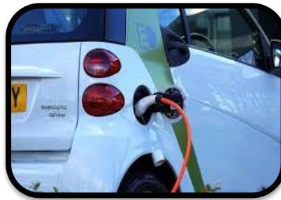
Batteries and vehicles