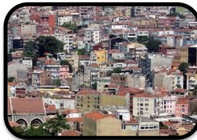
Construction and buildings