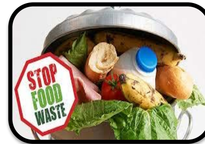
Food, water and nutrients