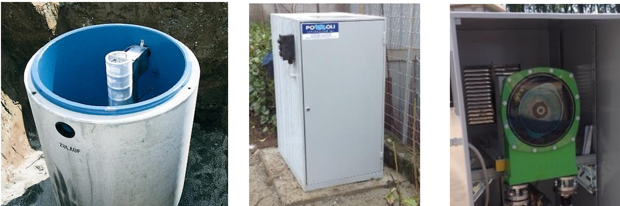
Figure 2. One of the tested VRT Systems: the sludge/oil separator (left), the control cabinet (center) and the peristaltic pump (right).