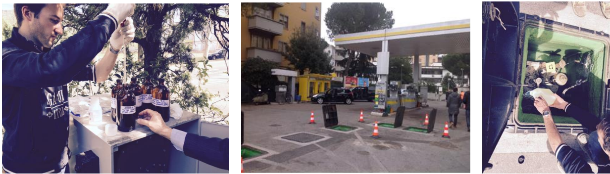
Figure 3. Testing performance of the VRT System: sampling operations (left), the testing site (centre) and testing preparation of the manholes (right).