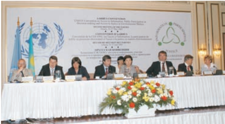
Environment Ministers from Europe and Central Asia exchange views with representatives of non-governmental organizations, the judiciary and parliaments.

rights. Governments increasingly recognize that environmental legislation will only be effective if individuals have a formal right to obtain environmental information, are empowered to participate fully in environmental decision-making and have redress to the courts when necessary.