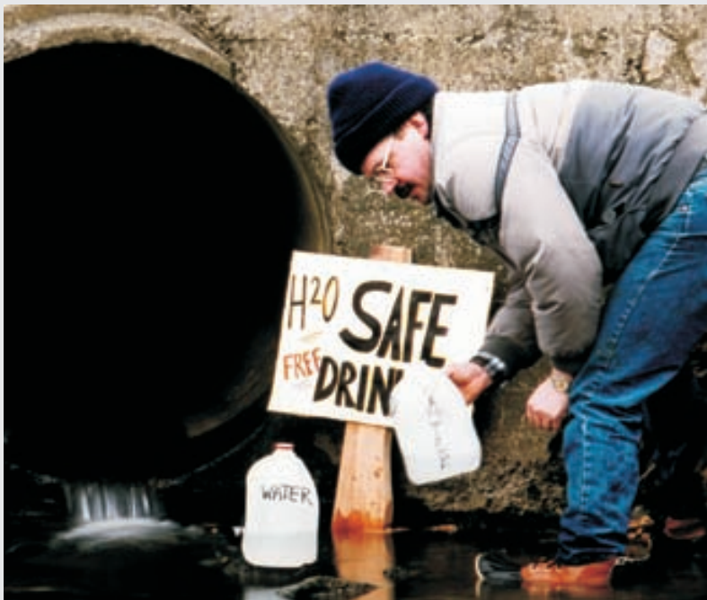
The Aarhus Convention responds to people's concerns about the quality of their environment, including drinking water.

It was to address situations like this that the Aarhus Convention came into being. While the overall example is fictitious, the elements that compose it are all too real and commonplace.