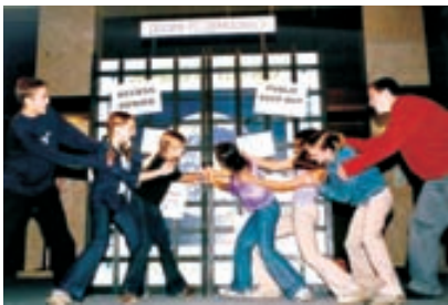
Top: children attempt to force open the Doors to Democracy during a ceremony held to mark the entry into force of the Convention (October 2001). Bottom: Finally the doors open.

To ensure the Convention's effectiveness, its member States will continue to promote capacity-building activities, particularly in the countries of Eastern Europe, the Caucasus and Central Asia that are in transition to a market economy, as well as those of South-Eastern Europe. These activities will include support to environmental NGOs and efforts to strengthen national institutions. Several international and regional organizations are also actively engaged in capacity-building activities to support the implementation of the Convention.