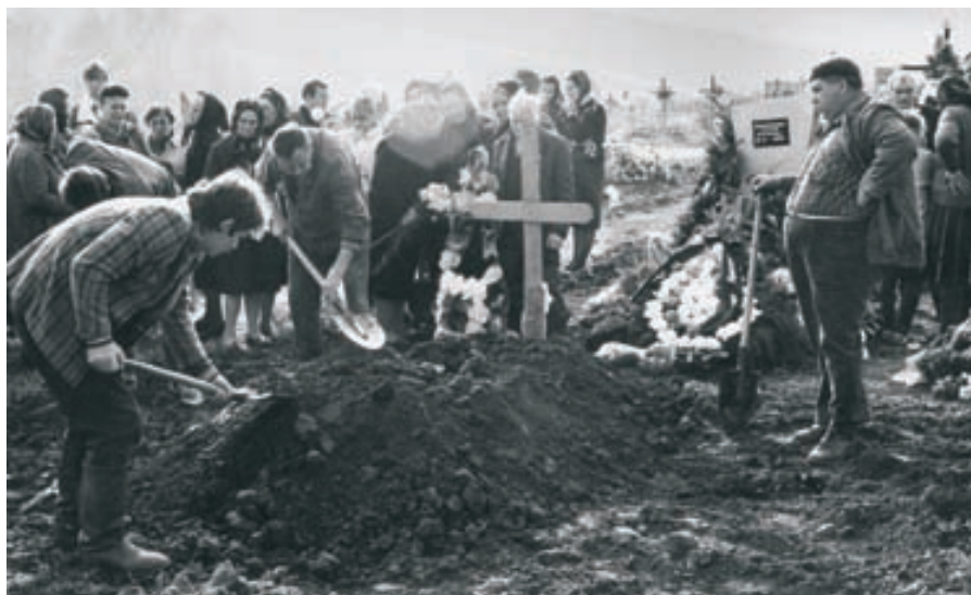
The Chernobyl nuclear disaster of 1986, which released a radioactive cloud across Europe, led to calls for greater transparency and was referred to by delegates several times during the Aarhus Convention negotiations.

What information can I ask for? Anyone can ask for any environmental information possessed by any governmental agency or any private body that serves a public function. The person making the request does not have to be a citizen or resident of that State and does not even have to provide an interest or a reason. NGOs can request information regardless of where they are legally registered.