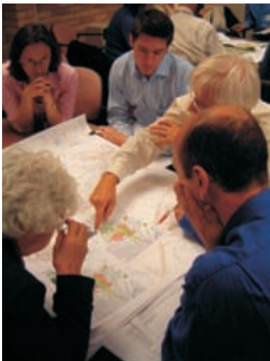
The Convention's broad definition of "environmental information" includes air, water, soil, and biological diversity.

If the request is too general or "manifestly unreasonable", it may be rejected on those grounds. In that case, the source of the request must still be notified.