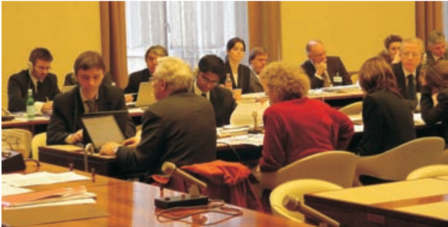
Experts meet in Geneva to discuss challenges in delivering access to justice under the Convention.

global stage. This means that the Convention is open not only to the UNECE's 55 member States but to any member of the United Nations.