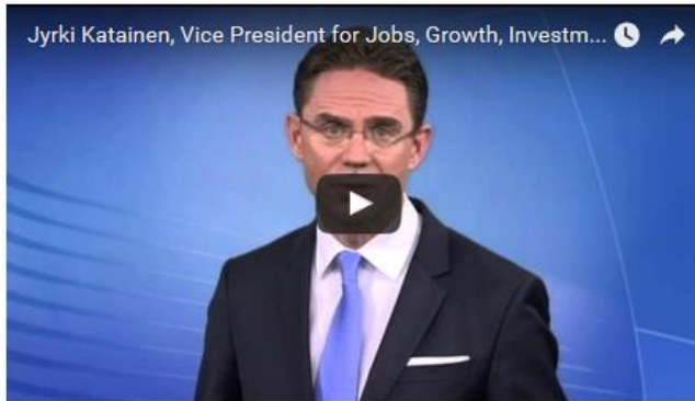
EU Investment Offensive: Vice-President Katainen kicks off investment roadshow

The European Investment Project Portal (EIPP) is a publicly available, secure web portal where EU based project promoters seeking external financing, are given the opportunity to promote their projects to potential investors.