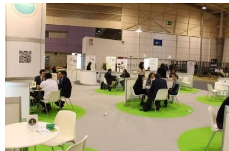
brokerage B2B / B2C and "Innovation in Time"