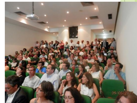
Meetings (formal and informal)