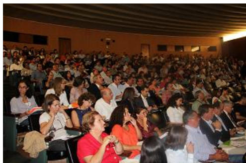
Workshops and seminars about innovation and H2020