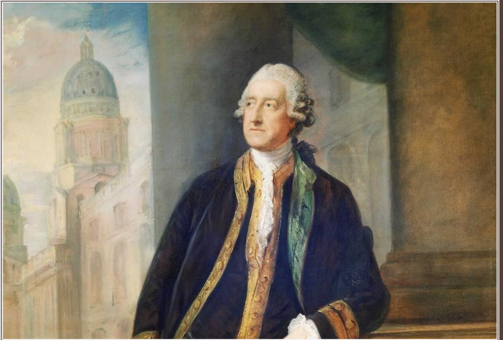
John Montagu, 4th Earl of Sandwich