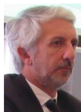
Guido Castellano and Petr Lapka, DG AGRI, European Commission

The EAFRD is performing relatively well, in terms of actual expenditure, as compared to other European Structural and Investment Funds (ESIF). To date, the average EAFRD implementation rate for the EU28 is 32%, with Priority 4 ('Restoring, preserving and enhancing ecosystems') being the most advanced. However, certain measures are lagging behind, especially under Priorities 3 ('Promoting food chain organisation, animal welfare, risk management'), 5 ('Promoting Resource efficiency, low carbon and climate resilience'), and 6 ('Promoting social inclusion, poverty reduction, economic development'). Long-term investments, energy efficiency related operations, LEADER and 'soft' Measures (Knowledge transfer, Advisory services, Cooperation) show only limited uptakes. It is important to bring these Measures up to speed, overcoming the identified bottlenecks in due time to avoid re-programming of the performance reserve in 2019. In a way the Performance Review is a pilot for the post-2020 period as it allows the reallocation of the EU budget to those priorities that have delivered the expected results.