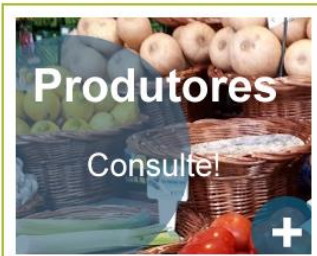
Os nossos produtores