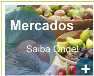
Mercado de Produtores