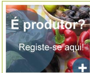
Ficha de registo