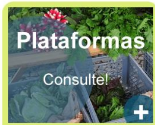
Comércio de Proximidade