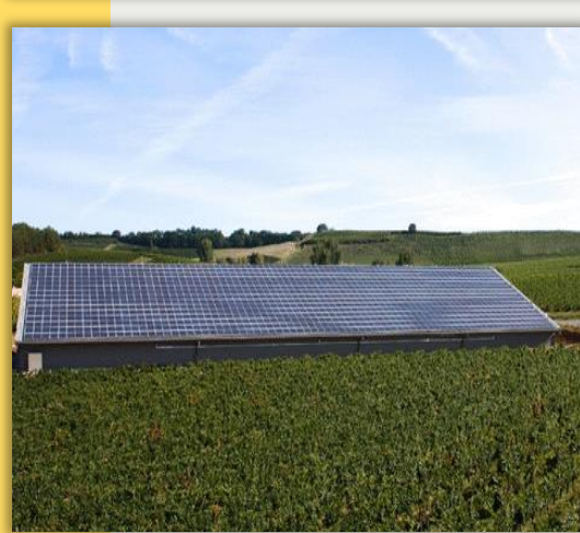
Agrisolar Barns