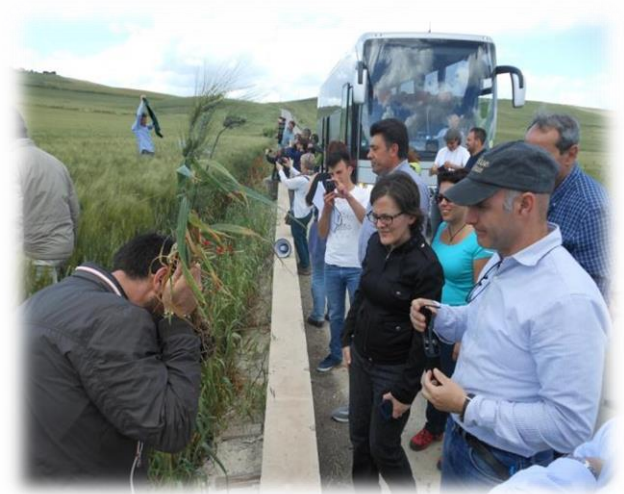
PUGLIA - azienda agricola DBN, Spinazzola (BAT)