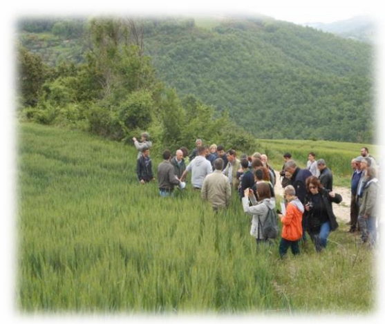
UMBRIA - Azienda «Tenuta di Biscina», Gubbio (PG)